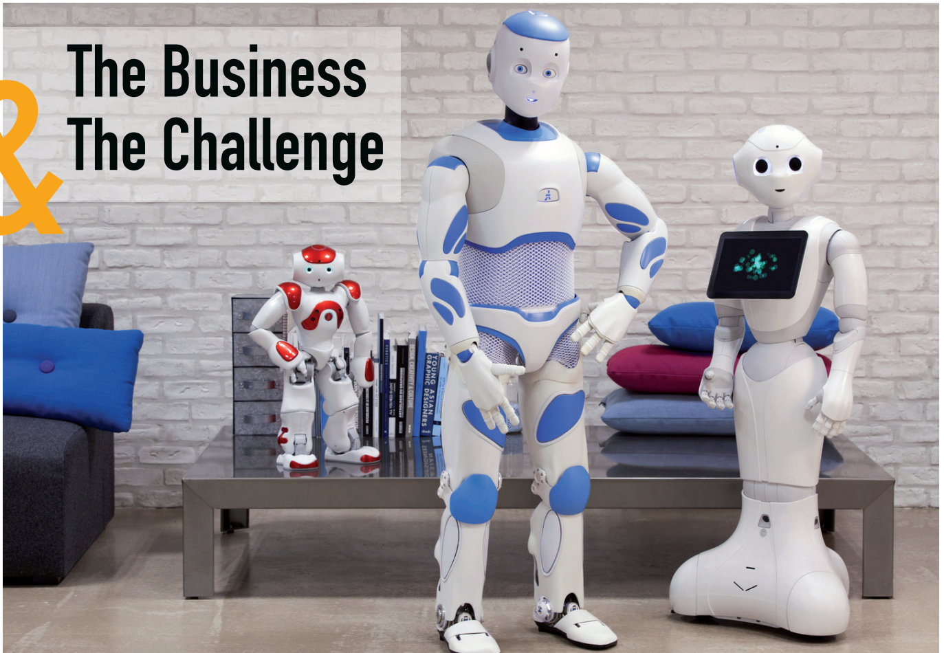
[Nao (on the left) was born in 2006. 9,000 Naos are now in use all over the world.]