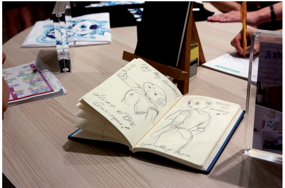
[Nao's Visitors Book in a recent event]

«A flexible tool, which enables the different teams to view the system as a whole, »